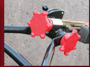
STANDARD PITCH Infinitely Variable Std Adjustment